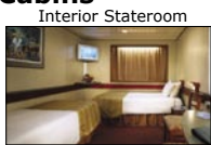
(Category 4A - 4D)

Note: Cabins in categories 4A-6D have two twin beds that can be combined to form a king-size bed. Some cabins can accommodate third & fourth passengers.