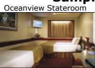
(Category 6A - 6D)